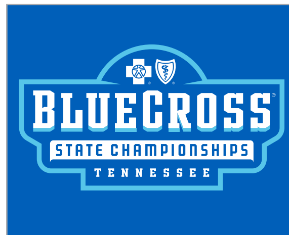
FULL-COLOR ON COLORED BKGRD