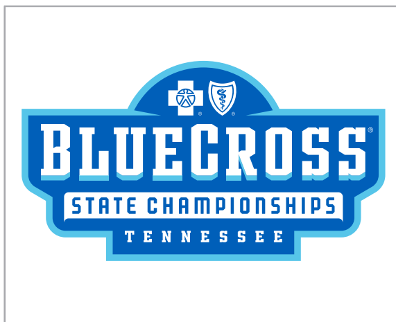
FULL-COLOR ON WHITE BKGRD