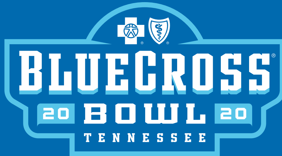
BLUECROSS BOWL SECONDARY LOGO