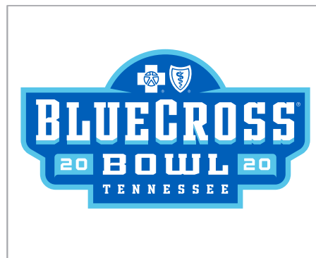
FULL-COLOR ON WHITE BKGRD