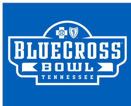
ONE-COLOR ON COLORED BKGRD