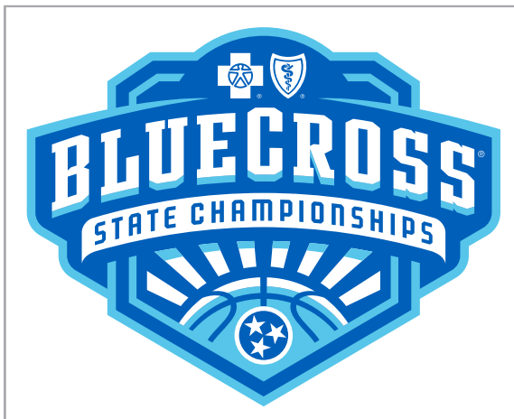
FULL-COLOR ON WHITE BKGRD