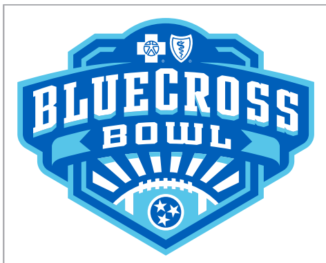
FULL-COLOR ON WHITE BKGRD