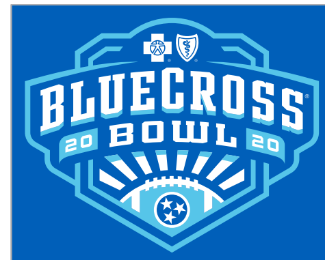
FULL-COLOR ON COLORED BKGRD