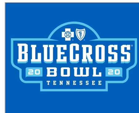
FULL-COLOR ON COLORED BKGRD