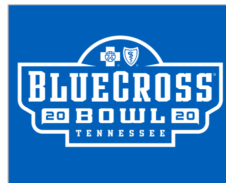
ONE-COLOR ON COLORED BKGRD