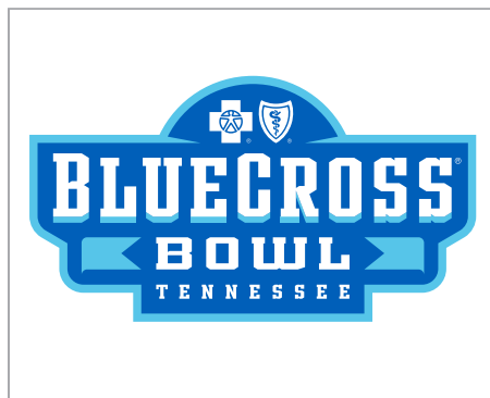
FULL-COLOR ON WHITE BKGRD