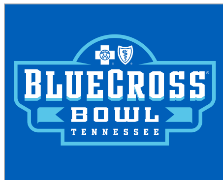
FULL-COLOR ON COLORED BKGRD