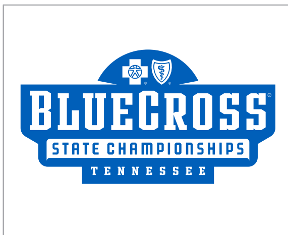
ONE-COLOR ON WHITE BKGRD