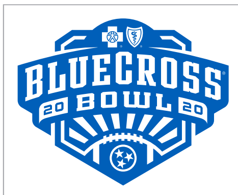
ONE-COLOR ON WHITE BKGRD