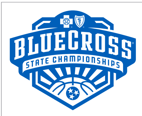
ONE-COLOR ON WHITE BKGRD